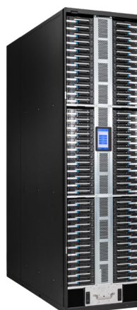
Scalar i7 RAPTOR.