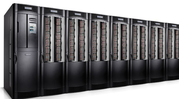
Scalar i6000 features ultra-high density and a 19-inch rack form factor, and scales from 100 to 14,100 cartridges.