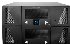
Scalar i6 control module.