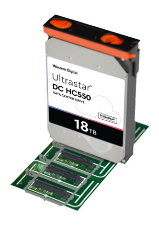
Figure 3. Precise cuts in the baseboard for vibration reduction

IsoVibe is a collection of Western Digital patented design innovations. Precise cuts in the baseboard act as a suspension for the drives providing isolation from the vibration transmitted from one drive to another. Vibration-isolated fans also minimize acoustic vibration, suppress noise transmission and reduce the amount of transmitted interference.