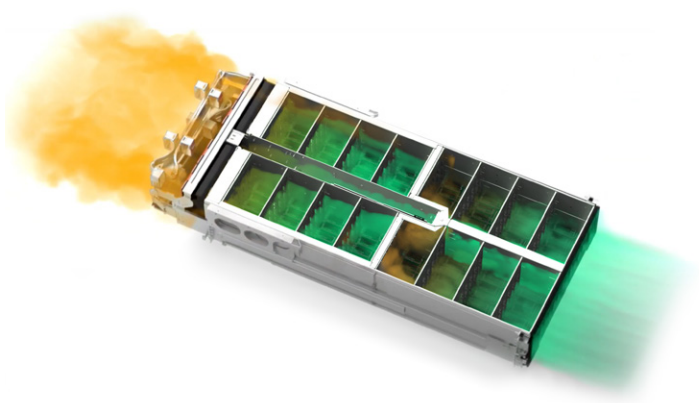
Figure 2. Ultrastar Data102 showing thermal zones and airflow

The enclosure is divided into two main zones, with rows of drives in the front, and rows of drives in the back. The front zone is cooled conventionally with the air drawn in from the cold aisle, but the warmed air is then ducted around the sides of the rear zone directly to the hot aisle. For the rear zone, cold air is drawn straight from the cold aisle into the center of the box and distributed through the rear drives, and to the exhaust on the hot aisle. This new Western Digital technology brings innovation to a well-established product segment and delivers significant benefits.